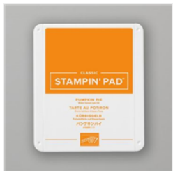
Pumpkin Pie Classic Stampin' Pad - 147086