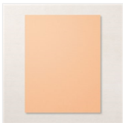
Pale Papaya 8- 1/2" X 11" Cardstock - 155668