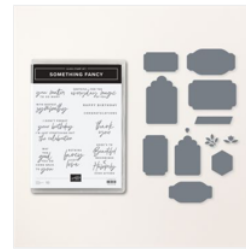
Something Fancy Bundle (English) - 160425