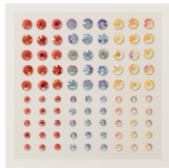
Iridescent Pastel Gems - 160429