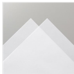
Vellum 8-1/2" X 11" Cardstock - 101856