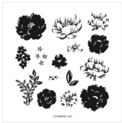
Two-Tone Flora Photopolymer Stamp Set - 160844

Tami White tami@stampwithtami.com www.stampwithtami.com