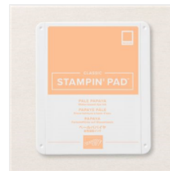
Pale Papaya Classic Stampin' Pad - 155670