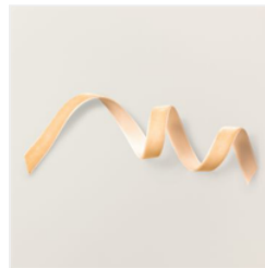
Pale Papaya 1/2" (1.3 Cm) Faux Velvet Trim - 160535