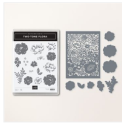
Two-Tone Flora Bundle (English) - 160414