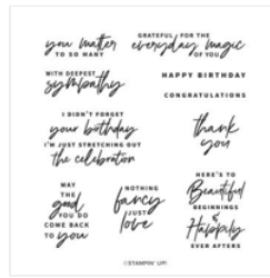
Something Fancy Cling Stamp Set (English) - 160416