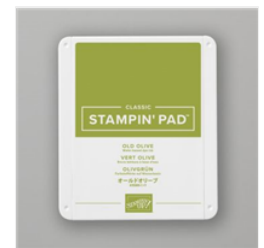
Old Olive Classic Stampin' Pad - 147090