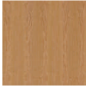
Cherry Flat Cut