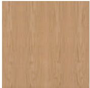
Red Oak Flat Cut