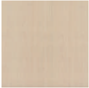
Maple Flat Cut