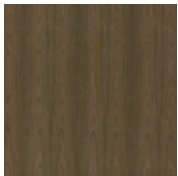
Walnut Flat Cut

Non-standard Species and Stains Over 100 species and cuts available.