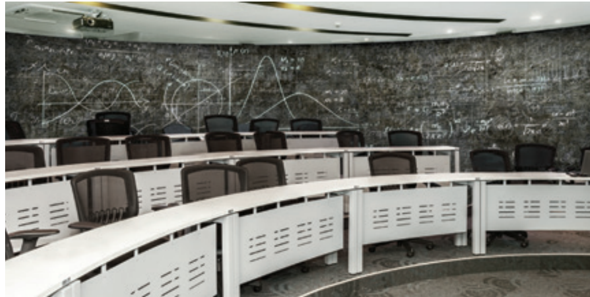
OPPOSITE Brainstorm shown in: L404803 Whiteboard (printed in white ink on window film)