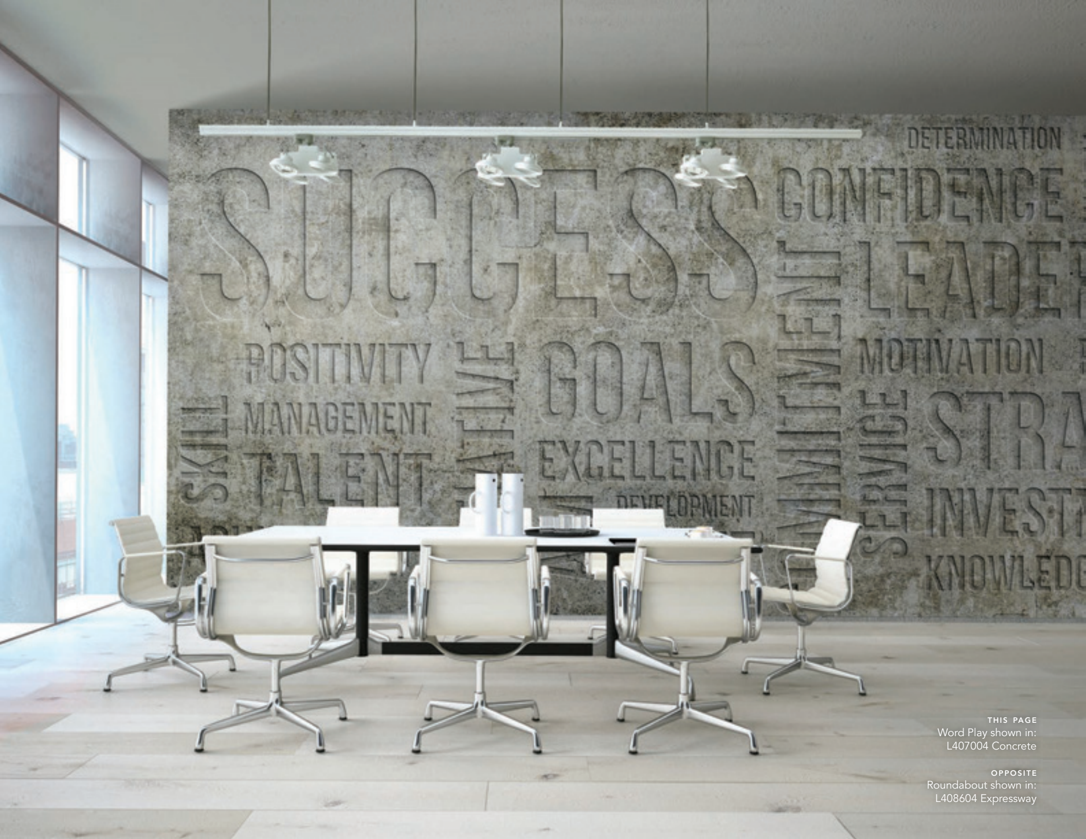
THIS PAGE Word Play shown in: L407004 Concrete