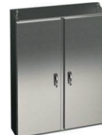
Enclosures & AC