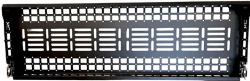
(1) Flip-Down Attic Shelf