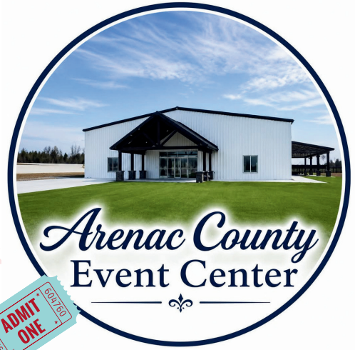
Arenac County EDC

The Arenac County Fairgrounds has been the site of the annual Arenac County Fair since it was established in 1890 and incorporated in 1946. The Fair is July 14–18, 2026. The grounds include event space, sheltered exhibition space; and a brand new Event Center with kitchen and dining and meeting area.