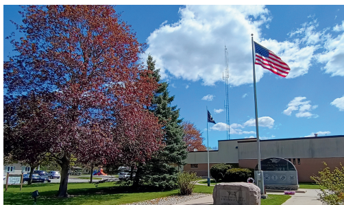
Above: The Arenac County Courthouse at 120 N Grove, Standish. Left: The Arenac County Veterans Memorial between the county courthouse and the Arenac County Jail in Standish. Below: The Arenac County Courthouse in 1907.

This project is dedicated to the Native Americans and immigrant settlers of Arenac County who through generations of family, faith, perseverance, sacrifice, pain and joy built and developed, literally from the ground up without any modern industrial or technological advancements, some of the very communities we still enjoy today..