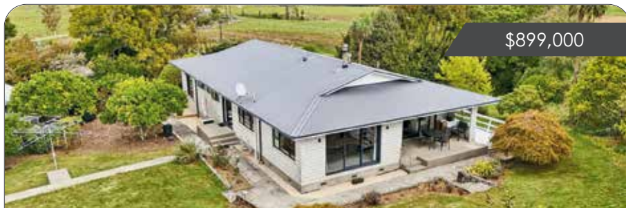
317 Abel Tasman Drive, MOTUPIPI 2023sqm

FABULOUS FAMILY HOME Immaculately presented & tastefully renovated, this fantastic family home offers quality throughout. Enjoy a rural outlook just minutes from town by car or bike. Features include spacious garaging, off-road parking, gardens, veggie beds, & a glass house. Perfect for family living. Don't miss out, this home needs to be viewed to truly appreciate.