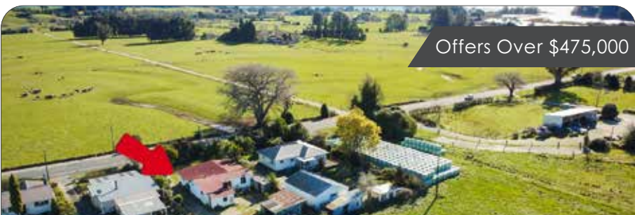
188 Abel Tasman Drive, TĀKAKA 875sqm

CALLING ALL DIYERS... There's some work to do on this place, but it's in a good location close to town, has a generous 875m2 section, a good water supply and lovely rural views. There's plenty of space in the 4-bedroom, 2-bathroom home.