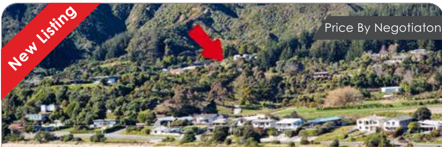
52 Nyhane Drive, LIGAR BAY 2376sqm

BLENDING NATURE & OPPORTUNITY Wake to shimmering sea views and unwind in the hush of native bush. This sunny, north facing 2376sqm section in Ligar Bay blends coastal charm with relaxed living. With some services in place, it's ready for your dream home or retreat.