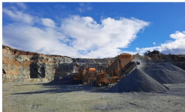
Above: Crushing gravel privately near Tarakohe where there's no council consent required. But Merv says river gravel is a high-end product that's still in demand.

"The whole process ends up costing around $10 a cubic metre... You have to do an environmental plan, a health and safety plan (which we have to do for everything, even if we've done the job 10,000 times, we are required to do it again. That's because we're stupid and can't remember, I guess - I can't think of another reason) and a works plan. And you can't process it on the river. So you have to cart it away to a site... If we could actually process on the river using a process screen, which screens out say -40 millimeter pieces, then all the larger stones get put up on the bank in a slope to protect it with a sloping riverbed - that wouldn't cost the Council anything." Solly says the consent process is supposed to take 21 days but usually takes much longer - so he gets most of his gravel from a private pit behind Tarakohe (pictured below) and his Dolomite mine.