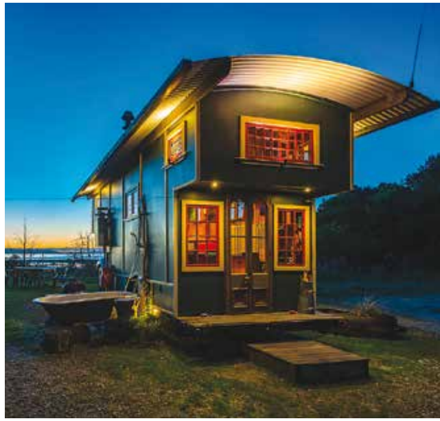
Illumination design for this hideaway is one of Switch Lighting's local projects.

Switch Lighting's full design service is guided by a belief that lighting should enhance the unique character of each