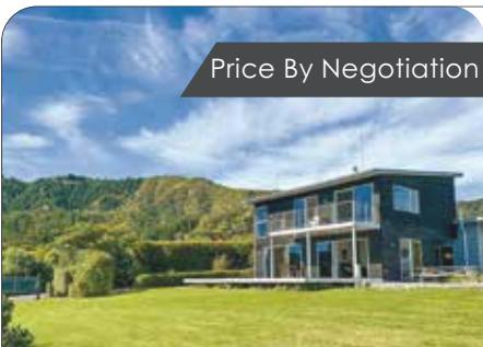
36 Nyhane Drive, LIGAR BAY 2500sqm