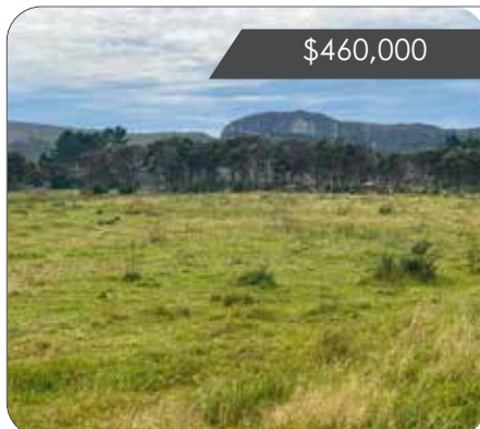
Lot 3 161 Wharariki Road, PŪPONGA $460,000

TITLE NOW ISSUED Kickstart your off-grid dream on this rural lifestyle block. Mostly flat, ready to build, and made for freedom. With title issued, it's your chance to live wild, raise a family close to nature, and build something truly yours. Escape the ordinary, call now.