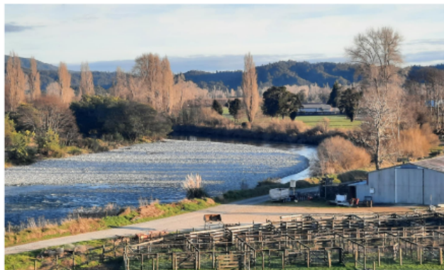
Above: Duncan McKenzie's stop bank curves with the river on the right hand side, shielding it from the main road south of Takaka township. On the left side is a swathe of gravel McKenzie has watched grow since the 90's. The river is squeezed over to the right, churning into the bank.

"Years ago, the river used to breach that stop bank at 1800 cubic metres per second. Now it breaches at 1400 cube. That's a decrease of 400 cube in the volume of water now breaching - and it's because there's no longer the capacity in the river to handle it," says McKenzie. So what's got a chokehold over Takaka River? In chime with Solly, Sangster and Bird (Part 1) - McKenzie says it's the slow and steady build up of gravel, which he has watched develop for years, on the opposite side of the river from his stopbank (pictured below.)