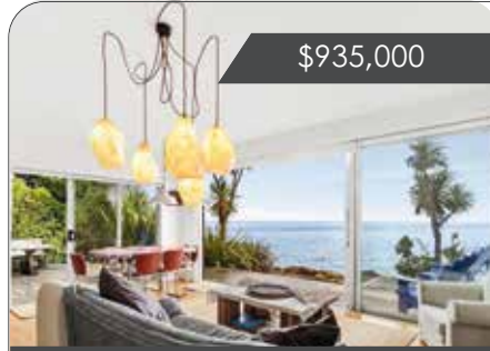
35 Tōtara Avenue, COLLINGWOOD 868sqm