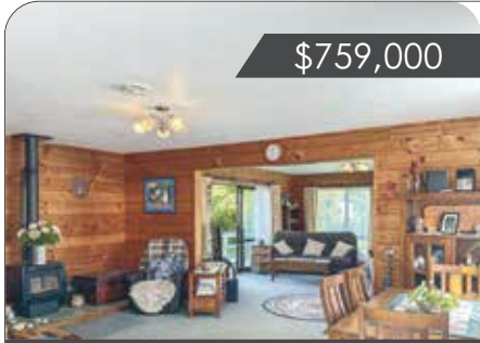
64 Abel Tasman Dr, TĀKAKA 1220sqm