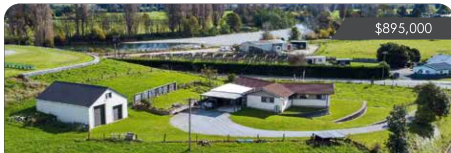
2075 Tākaka Valley Highway, TĀKAKA 4875sqm

PRIMO SPOT CLOSE TO TOWN This elevated 4875sqm site has sweeping views of the Tākaka Valley with the solid 2-bedroom house well-built to take them all in! Being just a short walk to Tākaka and the recreation grounds, plus having plenty of space and a large shed, this property is a rare find! Call me for more details or to make a time to view.