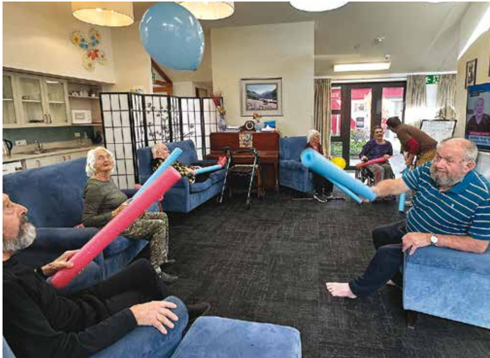
The Day Stay programme at Golden Bay Community Health will offer visitors morning tea, an activity and lunch in the company of the residential community.