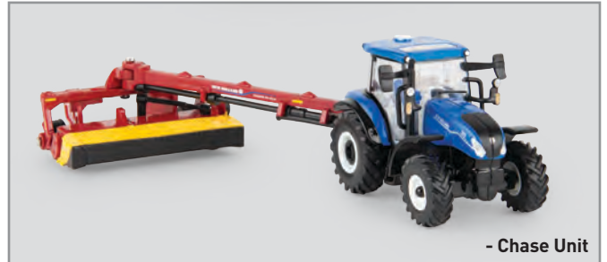
- Chase Unit

The set will commemorate the launch of the Powerstar tractor & updated yellow 313 PLUS Discbine. There will be 10% Red discbine chase units randomly inserted throughout the production run. "2026 Farm Show" will be printed on the cab roof. The tractor features die-cast body, hood, front axle. Clear windows with detailed interior. The discbine features die-cast frame, detailed features, and a swivel hitch.