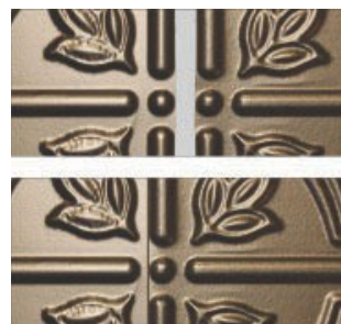
Bead + Button