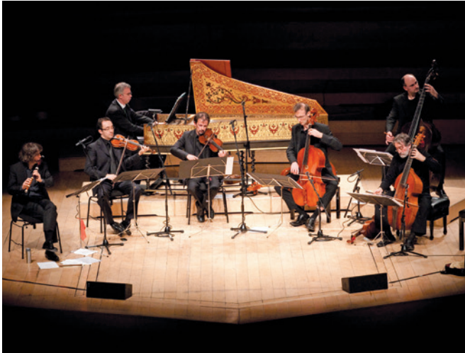
Jordi Savall & Le Concert des Nations performing Ofrena Musical