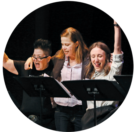
Cast members of POTUS in the Spotlight Festival