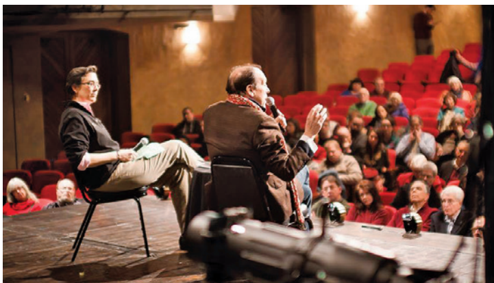
2019 Post-Show Discussion