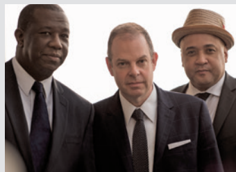
(l to r) Cecile McLorin Salvant, Stephen Crump of Vijay Iyer Sextet, Vijay Iyer Sextet, Bill Charlap Trio