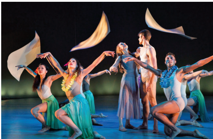
(top) Mark Morris Dance Group (bottom) BalletX