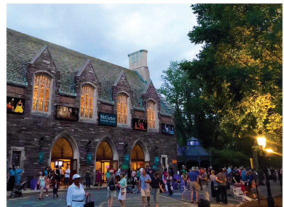
2019 McCarter Block Party