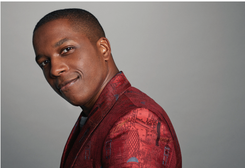
Leslie Odom Jr.