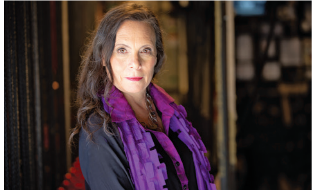
Artistic Director and Resident Playwright Emily Mann