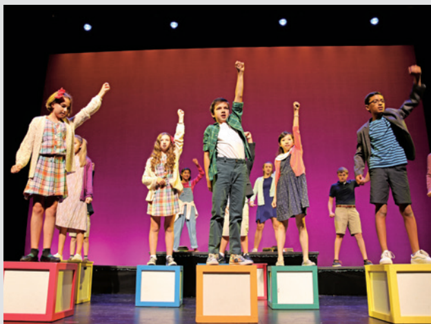
Summer Camp – Musical Theatre – Matilda