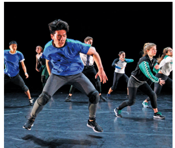
(top left to right) Students perform in the Princeton Dance Festival, Questlove, cast of Princeton University Lewis Center for the Arts' The Odyssey , students performing in the Princeton Dance Festival