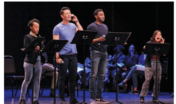
Cast of Early Decision , by Adam Gwon in reading of The Migration Plays