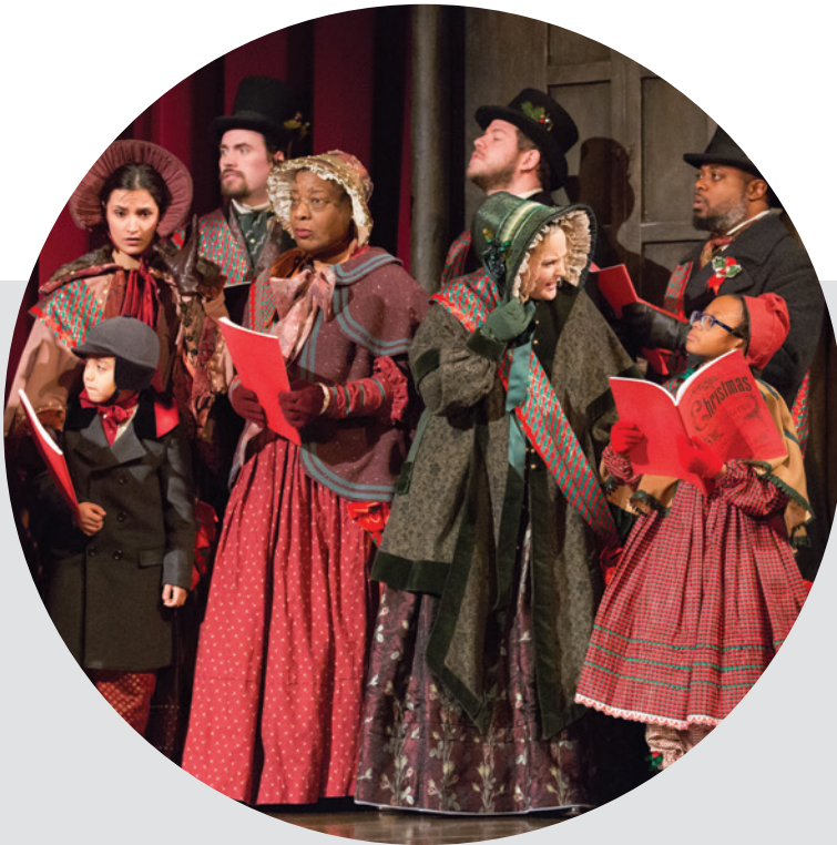
The ensemble of A Christmas Carol