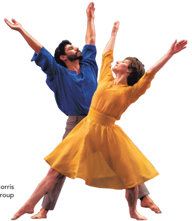
Mark Morris Dance Group

The Dance Series at McCarter is sponsored by The Jerome Robbins Foundation