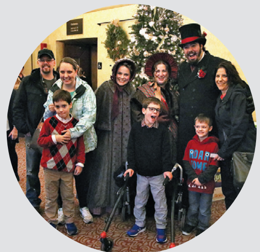
A Christmas Carol Sensory-Friendly Performance audience members with cast members of A Christmas Carol

McCarter’s Access to the Arts Program is made possible by: the Church & Dwight Employee Giving Fund, The Fund for the New Jersey Blind Inc., an endowment gift from the Gordon and Llura Gund Foundation, The Horizon Foundation for New Jersey, Investors Bank Charitable Foundation, The Karma Foundation, NJM Insurance Group, The Wawa Foundation, and Wells Fargo Bank.