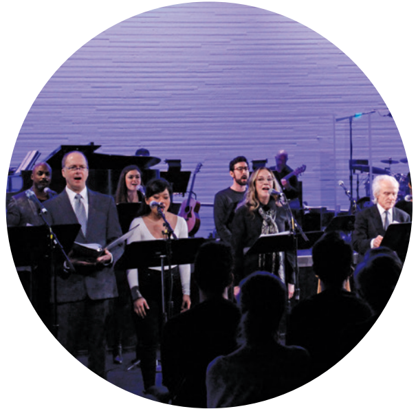
The cast of The Connector

McCarter and Princeton University collaborate frequently on special initiatives in which students, scholars and professional artists intersect. Recent projects include: The Ground on Which We Stand symposium on August Wilson, The Every 28 Hours Project , The Princeton and Slavery Project , Memory and the Work of Art , the Maria Irene Fornes Institute Symposium , The Migration Plays and the atelier of The Connector .