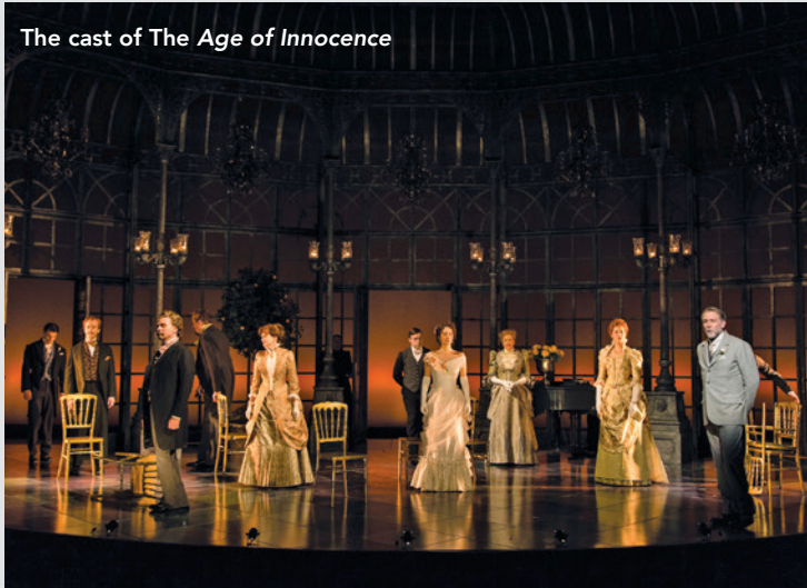
The cast of The Age of Innocence