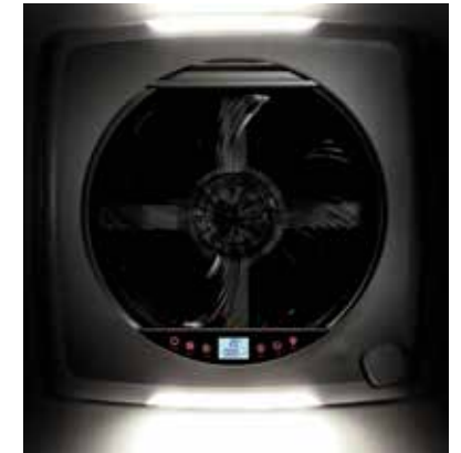
INTEGRATED LED LIGHT