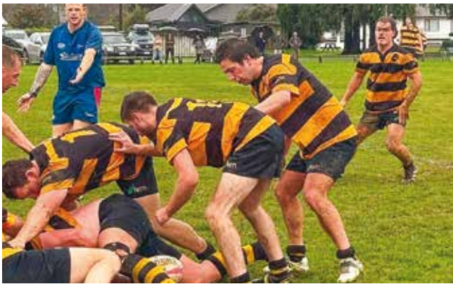
Collingwood about to clean a ruck against Murchison last Saturday.

To make things a bit more complicated, Tasman Rugby has added teams from White Star Seniors and Westport Seniors to make up numbers for tomorrow's bottom-half elimination finals.