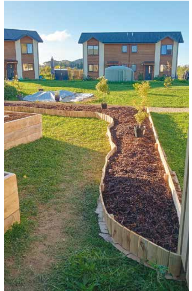
Newly created perennial garden bed using cardboard base with compost, and bark as mulch. Plants are placed to get best orientation before planting.

Some bigger projects may be on the cards with a little less on the garden. Examples include improving drainage, creating an outside patio area or building a new chicken house. Some infrastructure may need repair, or simply a clean-up too. Going through garden equipment, sorting stakes, string lines, cloche systems and even irrigation stuff makes sense to sort now. With spring not far away, make sure all the propagation materials are well organised. Is there enough seed raising and potting mix, trays are OK and heating pads are still working? Perhaps the hothouse needs a clean to improve light penetration.