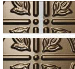
Bead + Button