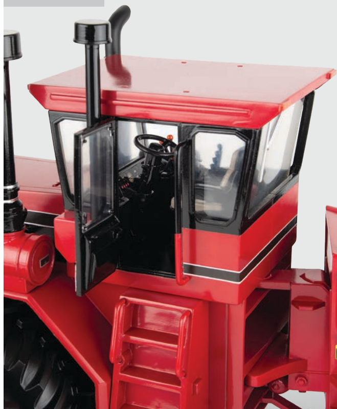
• Opening cab doors