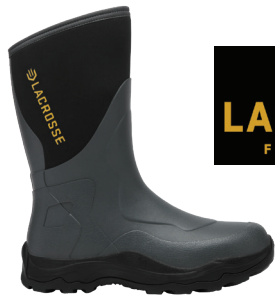
ALPHA AGILITY Field Boot 12" Height 336881 $170 M's Sizes 6-15