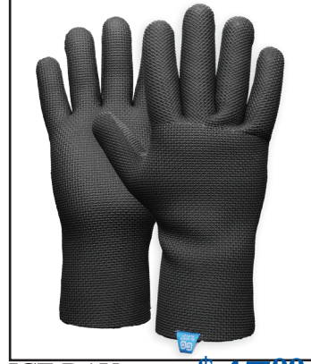
ICE BAY $47 99 2mm Neoprene, Waterproof Sharkskin Texture #813BK Size S-2X