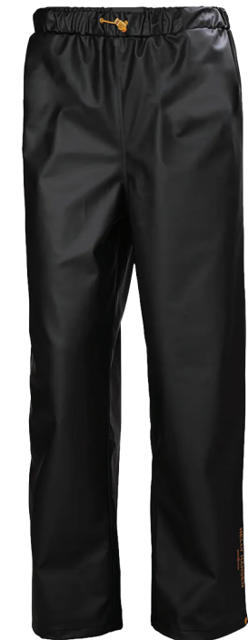
MEN'S GALE RAIN PANTS #70485 $75 Size S-4X