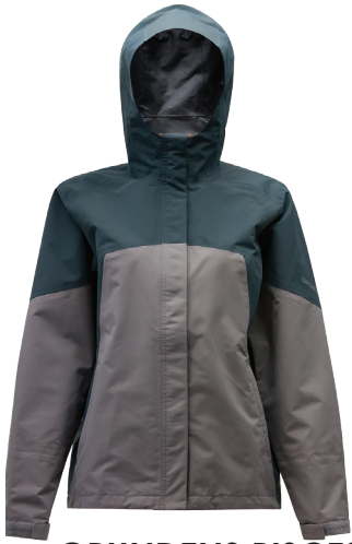
GRUNDENS PISCES #10378 $129 99 SALE: $99 W's Sizes S-XL