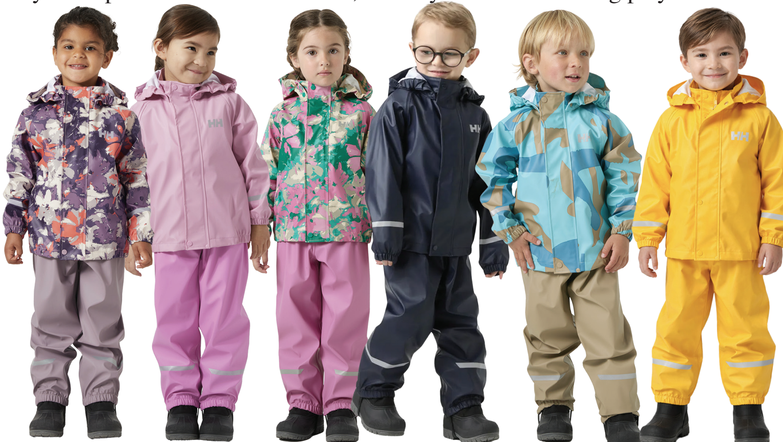
PURPLE CLAY PRINT #40511 Child 2-6 $95

HELLY HANSEN'S Kid's Bergen Rain Set includes a jacket & bib overalls fully waterproof with flexible fabric, for easy movement during play.