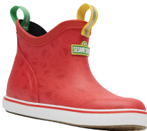
ELMO XKAB60ST $75 Child 7-13 Kids 1-5