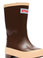
8" LEGACY BOOT 22681G Little Kid Sizes 8-13 - $70