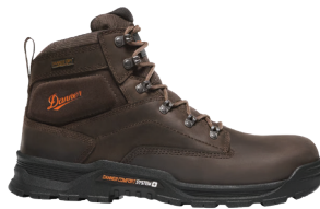
CRAFTER COMPOSITE TOE Leather Work Boot 17421 $220 M's Sizes 8-15 Reg. & Wide