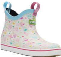
ABBY MULTI XKAB10ST $75 Child 7-13 Kids 1-6