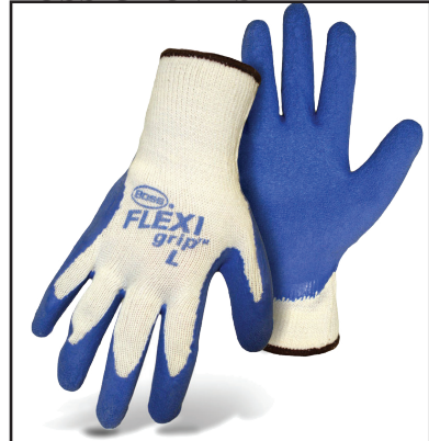
FLEXI GRIP STRING String knit polyester/cotton blend with blue latex coated palm #8426 Size S-XL $1 80 ea