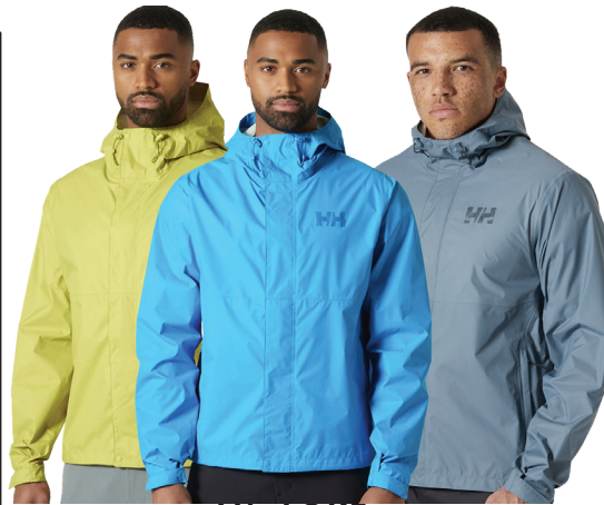
M's LOKE Lime - Sizes L, XL, 2X Cyan - Sizes XL, 2X Washed Navy - Sizes S, XL #63396 $130 SALE $99