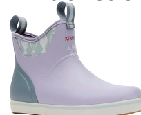
SALMON SISTERS-HALIBUT XWAB503 $125 W's Sizes 5-11