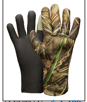
ALEUTIAN $44 99 Realtree MAX-7 Waterproof Sharkskin Texture #813BK Size S-2X