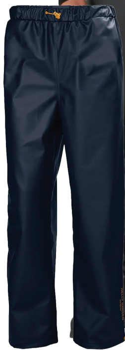
WOMEN'S GALE RAIN PANTS #70486 $75 Size S-3X