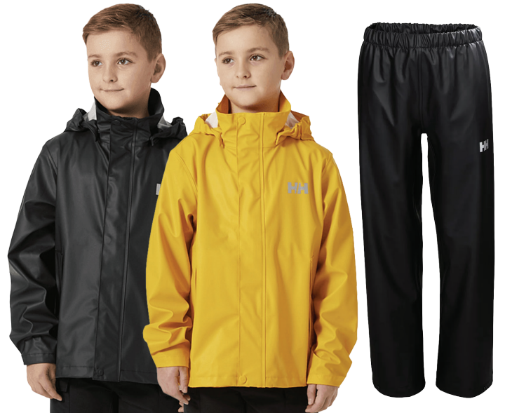
BLACK YELLOW RAIN PANTS

HELLY HANSEN: Waterproof, polyurethane coated polyester stretch fabric