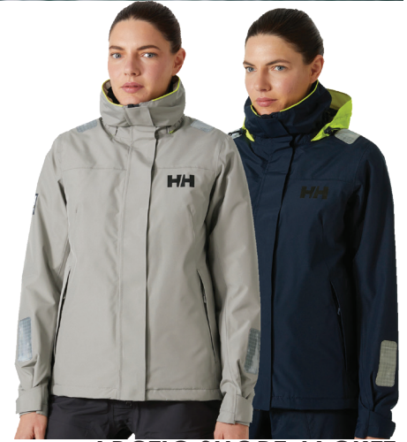
ARCTIC SHORE JACKET Grey W's Size XS-M, XL Navy W's Size XS - M #34381 $300 SALE $150