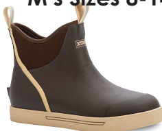
WHEELHOUSE WIDE XMW900 $140 M's Sizes 8-14