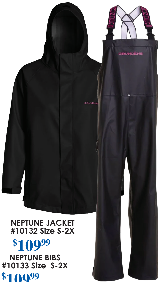
NEPTUNE JACKET #10132 Size S-2X