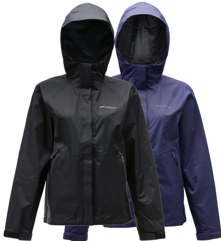
GRUNDENS AQUARIUS Black W's Size S-XL Huron W's Size XS - L #10379 $139 99 SALE $99