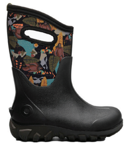
Yeti 73443 $95 Child Size 10-12 Kid's Size 1-5