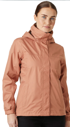
HELLY HANSEN ADEN W's Size 2X, 3X #10379 $130 SALE $99