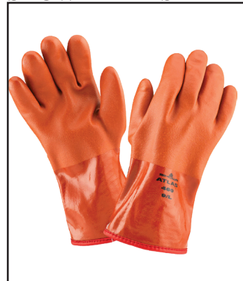
ATLAS 460 $24 99 Waterproof, Insulated, Flexible Double-dipped PVC #51040 Size S-XL