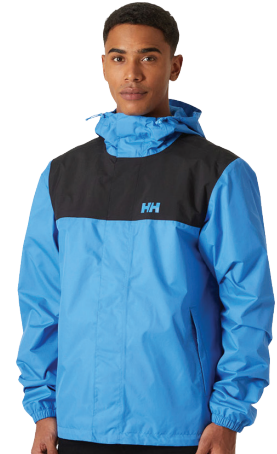
VANCOUVER Waterproof Breathable M's Sizes M, L #53935 $130 SALE $99