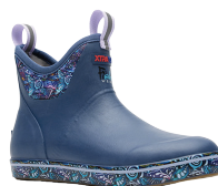
FISHEWEAR-GRAYLING XWAB2AG $125 W's Sizes 5-11