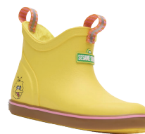
BIG BIRD XKAB70ST $75 Child 7-13, Kids 1-5