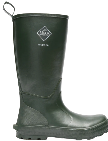
MUDDER Rubber Breakup Boot MUD333 $85 Sizes 5-15