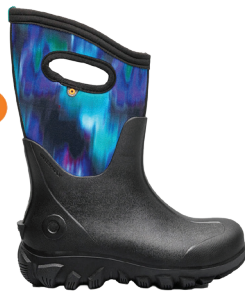
Northern Lights 73238 $95 Child Size 10-13 Kid's Size 3-6