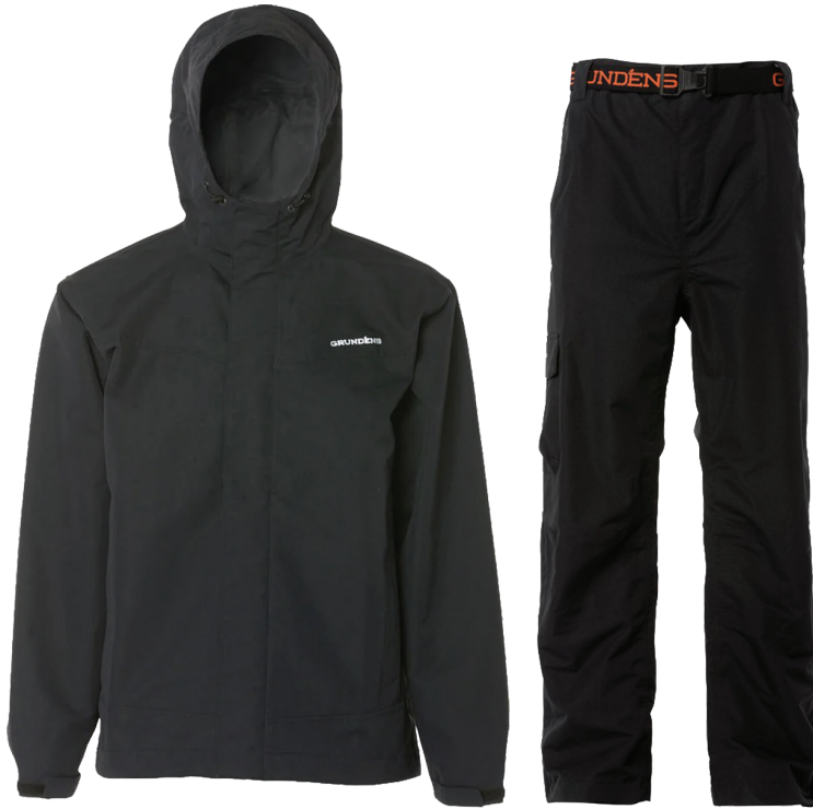
FULL SHARE JACKET #10329 Men's Size S-3X $149 99

GRUNDEN'S Full Share has a rugged 10K waterproof breathable exterior for long life and resistance to contaminants.