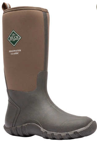
EDGEWATER BROWN 5mm Neoprene #ECH900 $135 Sizes 8-13