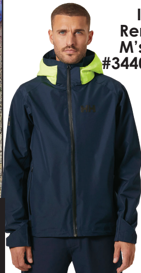
INSHORT CUP Removable Hood M's Sizes S, XL, 2X #34404 $250 SALE $125