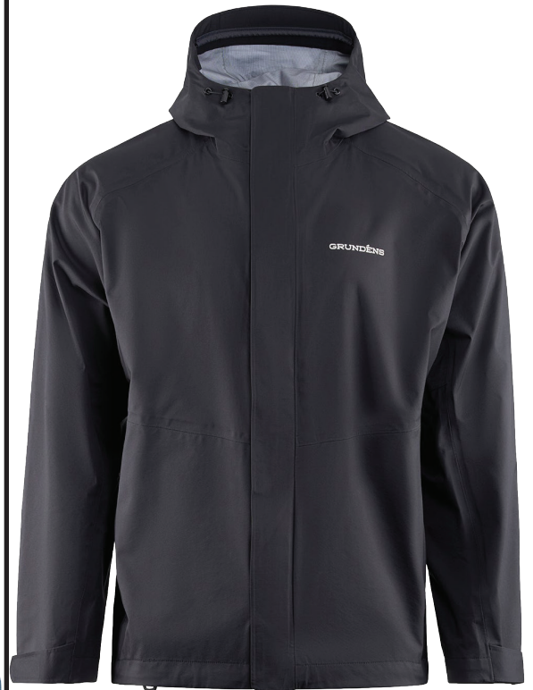
CHARTER JACKET #10214 Black, Blue $334 99 Men's Size S-3X $179 99

GRUNDEN'S Charter 3Layer Rain Jacket with 20K/20K Waterproof Breathable fabric in a Packable Rain Jacket