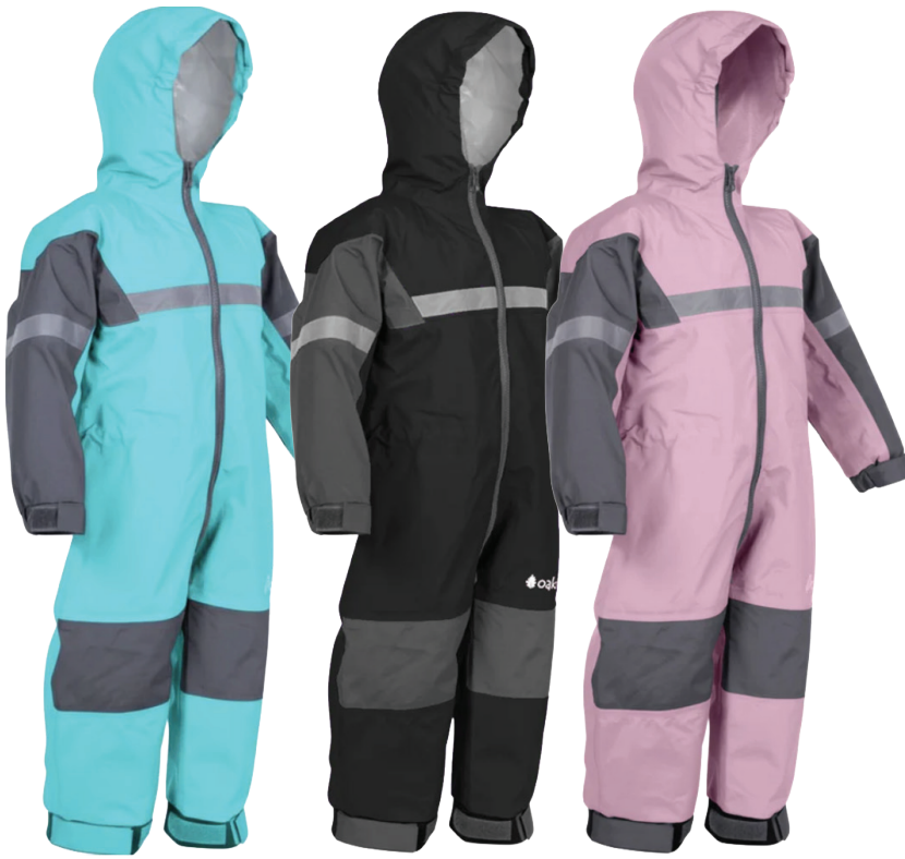
#23568 BLUE #23513 BLACK #23519 LAVENDER

OAKIWEAR Waterproof, Breathable Rain Suit, with taped seams. Brimmed hood, reflective strips, elastic cuffs, waterproof zipper.