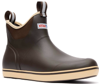
BROWN DECK BOOT 22734 $115 M's Sizes 8-14