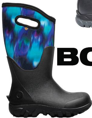
Northern Lights 73364 $150 W's Sizes 9-12