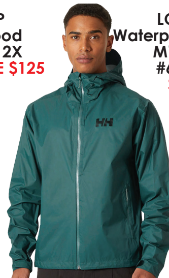
LOKE TERRA Waterproof Breathable M's Sizes S, L #63365 $140 SALE $99