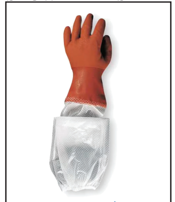
ATLAS 640 $29 99 Double dipped PVC Extended sleeves - 23.5 In. #51064 Size S-2X