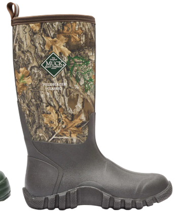
FIELDBLAZER EDGE 5mm Neoprene #FBFRTE $135 Sizes 7-14