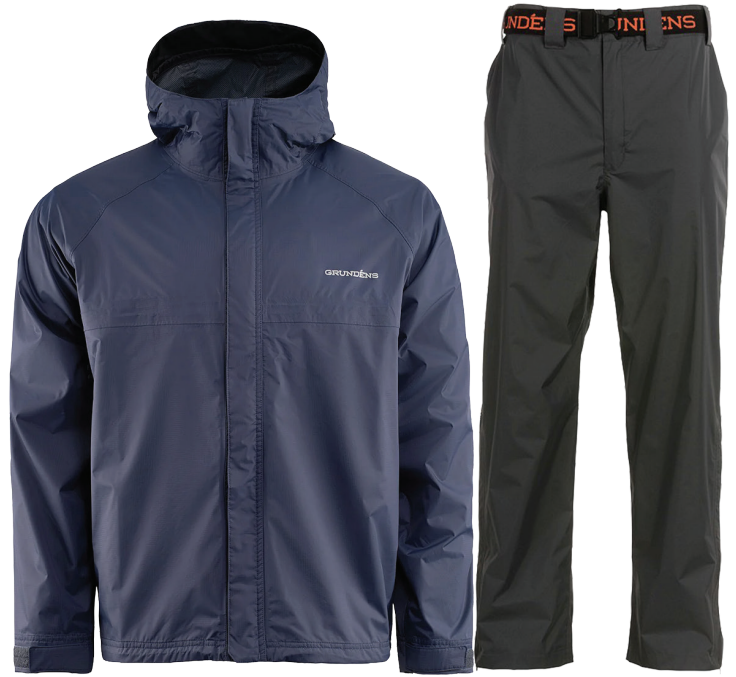
TRIDENT PACKABLE RAIN JACKET #10329 Men's Size S-3X $119 99

GRUNDEN'S Trident is lightweight, packable, 10K waterproof/breathable raingear for moderate foul weather protection.