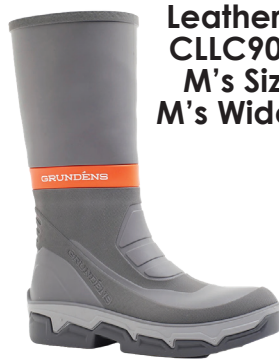
GRUNDENS DECK BOSS #60000 $80 $40 Youth Sizes 3, 4, 5