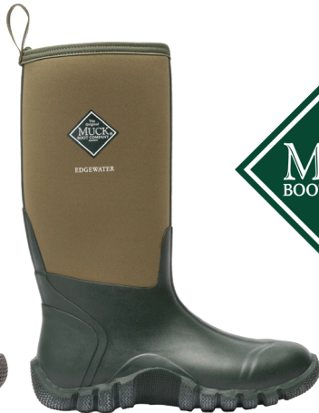
EDGEWATER MOSS 5mm Neoprene #EWH333T $135 Sizes 7-14