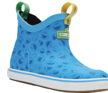
COOKIE MOSTER XKAB30ST $75 Child 8-13, Kids 1-4