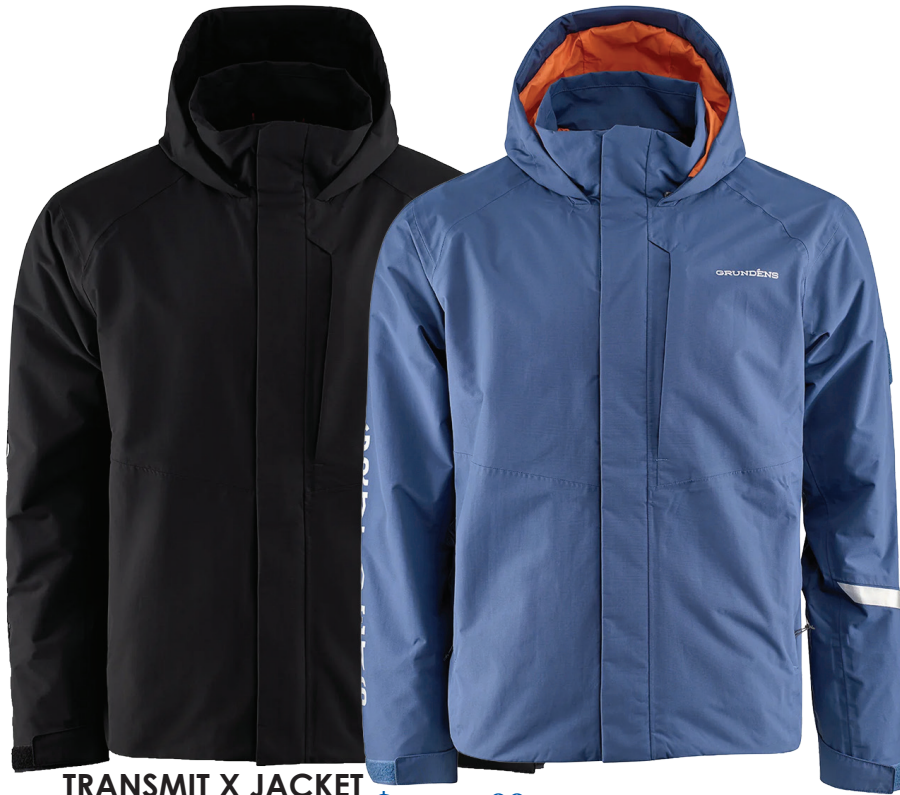
TRANSMIT X JACKET #10214 Black, Blue $229 99 Men's Size S-3X

GRUNDEN'S Transmit X rain jacket for wind driven downpours, with 15K waterproof and 10K breathable exterior with fishing-focused details including neoprene cuffs.