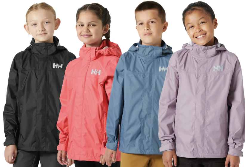
BLACK PINK BLUE LAVENDER

HELLY HANSEN Waterproof/breathable, zippered hand pockets for convenient storage, lightweight and packs down easily into a backpack or bag.