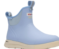
SPORT-SKYWAY XADSW200 $140 W's Sizes 5-11