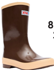
8" LEGACY BOOT 22680G Big Kid Sizes 1-6 $75