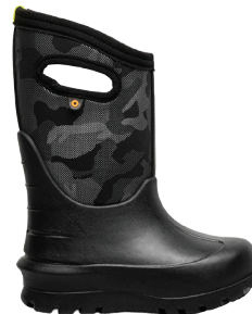
Metallic Camo 73238 $95 Child Size 8, 10-12 Kid's Size 1-5