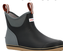
BLACK DECK BOOT XMAB001 $115 M's Sizes 8-14