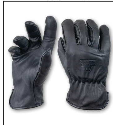
DRIVER GLOVES $36 Fleece-Lined, Leather Water Resistant #D409 Size S-2X