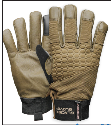
ALASKA PRO $59 99 Waterproof, Insulated Goat skin palms #775CT Size S-2X