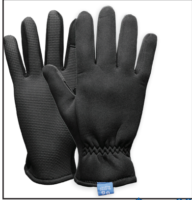
KENAI ORIGINAL $24 99 2mm Neoprene, Water Resistant Sharkskin Palm #51040 Size S-2X